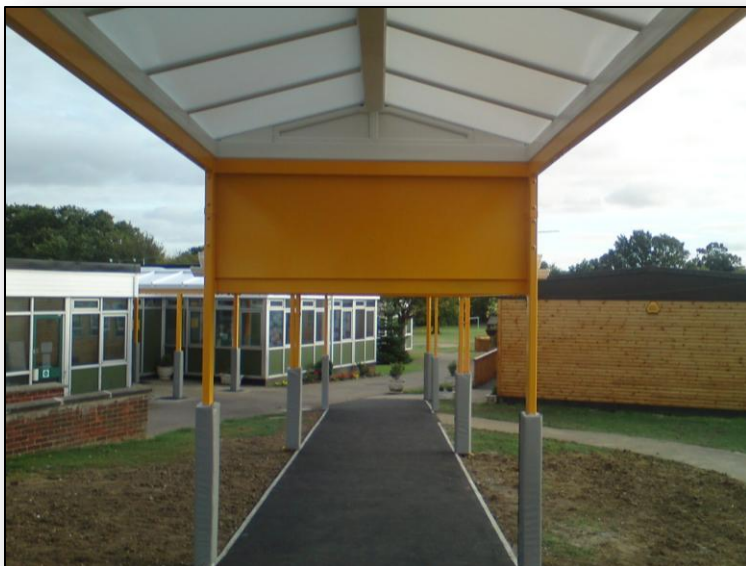
Finished Canopy Showing a Step in the Steel