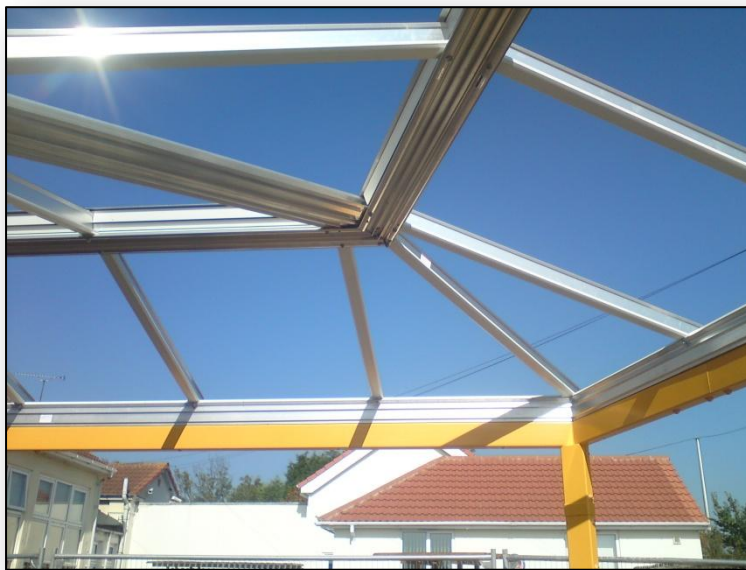
Installation in Progress – Canopy Frame