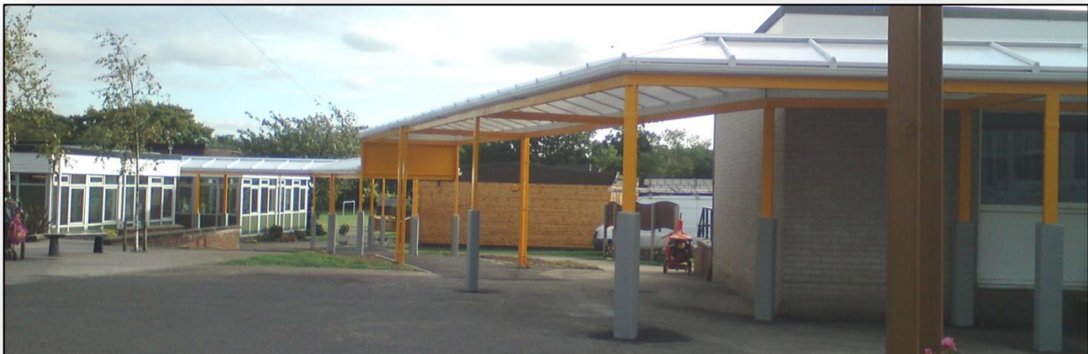
Above and Below: Finished Canopy

"Team on site fantastic - professional and extremely helpful." – Thundersley Primary School Deputy Head Teacher