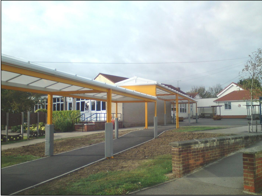
Above and Below: Finished Canopy